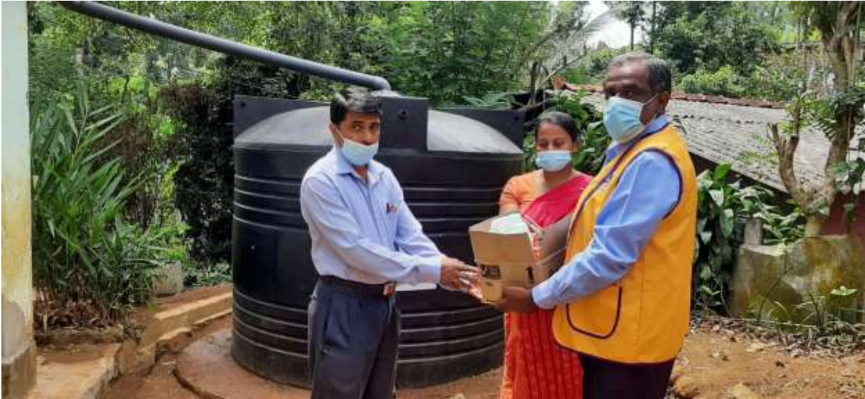
Handing over of painting materials to schools

The inspections were delayed overdue to current fuel problems affecting the country. Schools too are also seen to be badly affected by ongoing fuel and power issues.