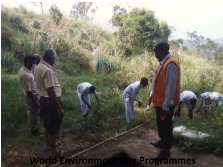
World Environment Day Programmes

Marking the World Water Day a shramdana / cleaning programme was organized in the Gonadika Vidyalaya on 20 th March. The schools premises and water resource areas were cleaned during this activity. 15 students and 25 school community members participated the programme.